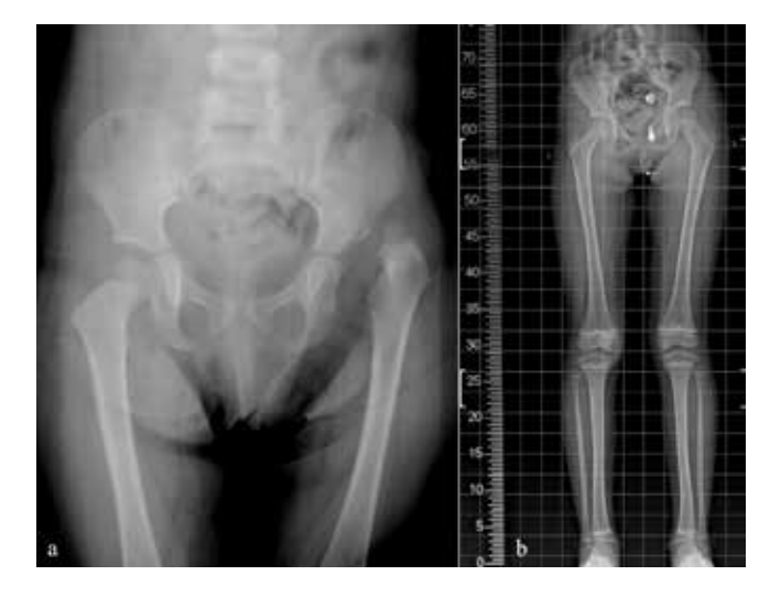
Figure 2. (a) Preoperative anteroposterior pelvic view of the 17-month old patient (b) A full-length standing AP computed radiograph of the same child 4 years after medial open reduction. Left femur 15 mm longer than the right femur.

Social Sciences version 22.0. The distribution of continuous variables was determined by Kolmogorov-Smirnov and Shapiro-Wilk normality tests. Quantitative and qualitative data were expressed as mean ± standard deviation and percentage, respectively. In addition, data that were not normally distributed were expressed as median (minimum-maximum). The Mann-Whitney U test was used for the comparison of two groups that were not normally distributed. The Chi-Square test was used for correlation test was used for correlation of parameters that were not normally distributed. The Wilcoxon signed ranks test was used to compare dependent variables that were not normally distributed. A p-value of less than .05 was considered statistically significant.